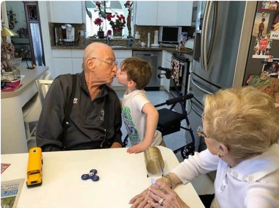
Dad with first great grand child