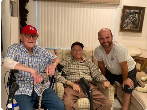
Three Sons of Bauches