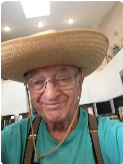
Happy Birthday Dad!