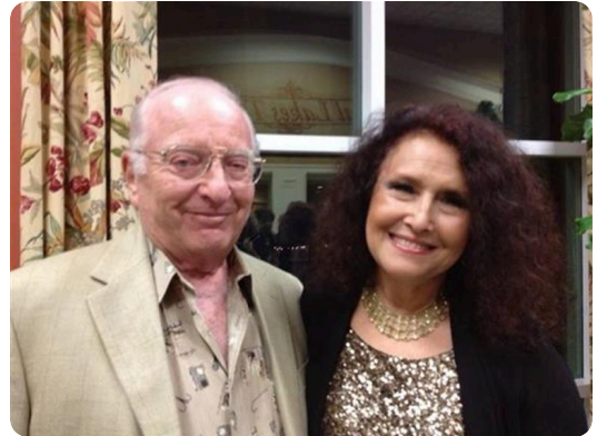
Dad with Melissa Manchester