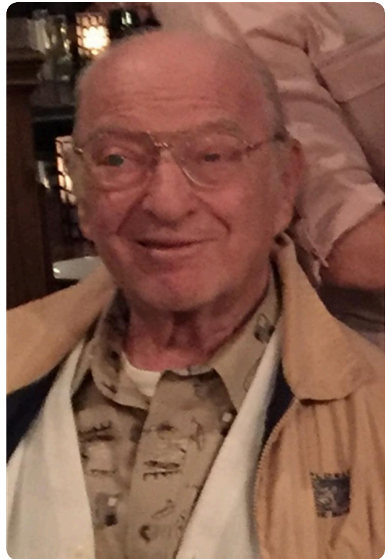
Dad at his 90th