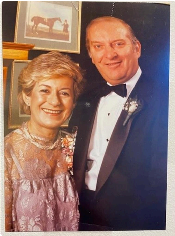
Mom & Dad