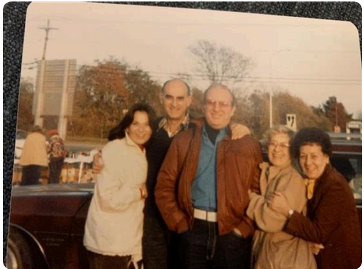
Dubno Cousin's club trip